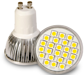
LED Spots 230 V with GU10 - Sockets