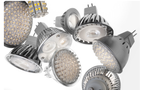
LED Spots 12 V with GU5.3 - Sockets

To avoid these problems, it is recommended to plan 220 V - 230 V spots in larger renovation works or new constructions.